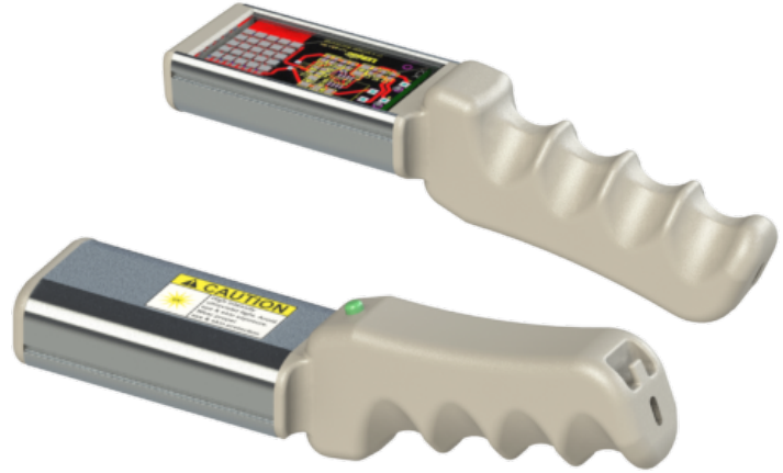
25 UV-C LED Inactivation Wand

Caution: UV-C energy. Must where required safety equipment.